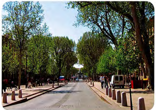
The tree lined boulevard is the classic urban landscape in many European cities. Cours Mirabeau, Aix-en-Provence, France.