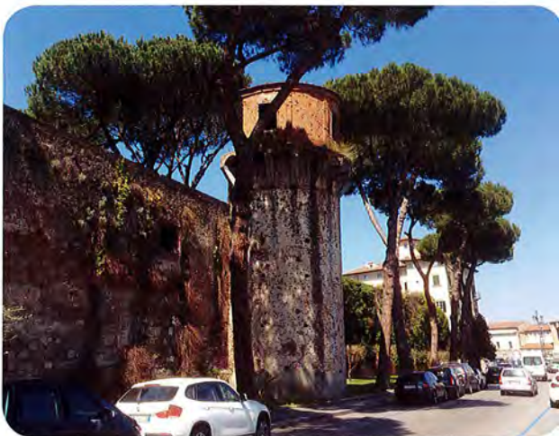
Pine trees are characteristic of Mediterranean cities and create a 'sense of place'. The shade benefits to pedestrian route ways is also notable. Pisa, Toscana, Italy.