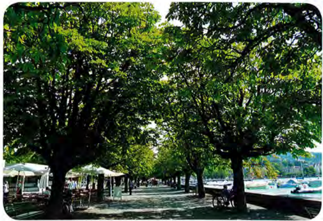
The urban forest sets the scene for important recreational areas such as the General Guisan Quai, Zurich, Switzerland.

18. An Urban Forest forum in a territory may be appropriate in some situations to bring together stakeholders into an urban forestry stakeholder collaboration.